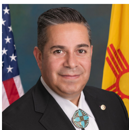
Senator Ben Ray Luján

The panelists will discuss the new federal funding to plug, remediate, and restore orphaned oil and gas wells in New Mexico and across the country. Last year, Senator Luján led the $4.7 billion legislation, which was included in the Infrastructure Investment and Jobs Act. Plugging and remediating these wells will create tens of thousands of jobs nationally while reducing climate emissions, local environmental impacts, and public health risks. Please share this with your networks.