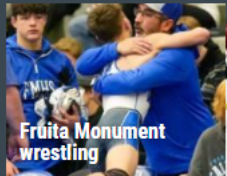
Fruita Monument wrestling