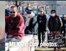
MLK Jr. Day photos