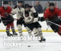
Colorado Mesa hockey